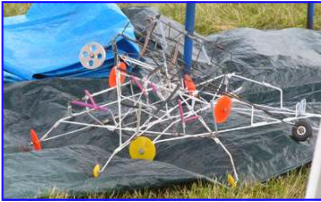
NATS Speed — Jumble of dollies, little bitty airplanes, moving at speeds that are really hard to photo graph. But sure is fun to watch the foot shuffle in the center.