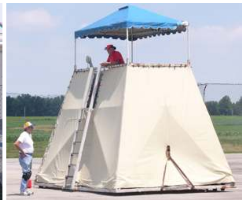
Pit man requesting a blessing from the Tower God.